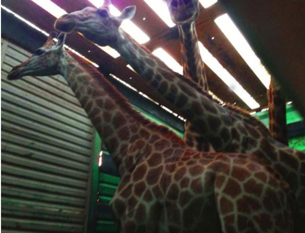
The last goodbye!