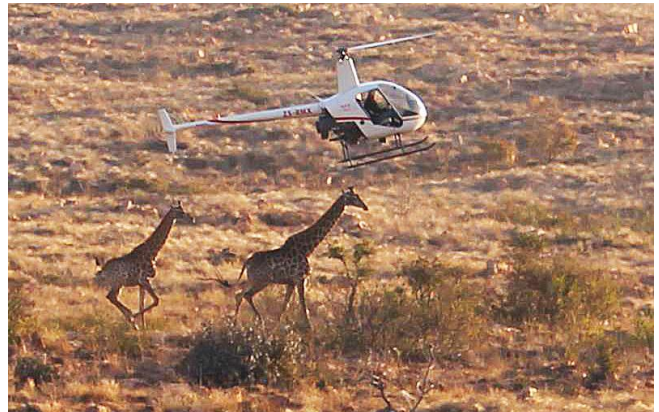
The helicopter pilot had to do some tricky manoeuvres to get the giraffe to head in the right direction!